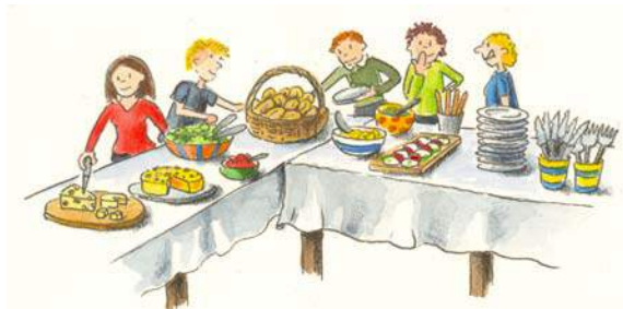
Table and chair set up at 5:00 p.m, dinner set up at 5:30p.m. After dinner the meeting will begin.