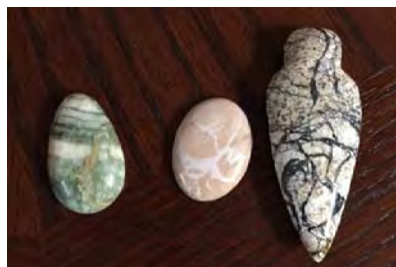
Lapidary & Cabochon Design

Come take a class and see how much fun it is!