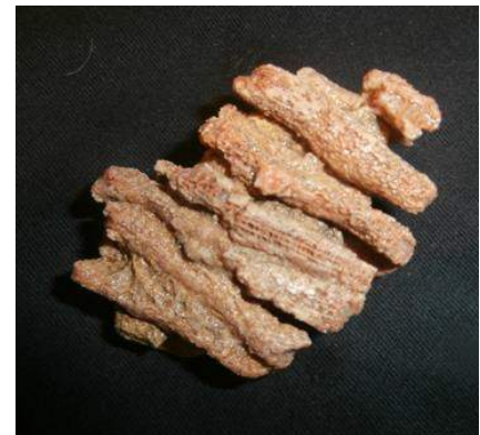
Dakota Sommers' beautiful Coral find