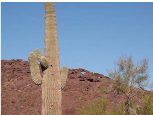
Eye in the mountain, Quartzside Field Trip