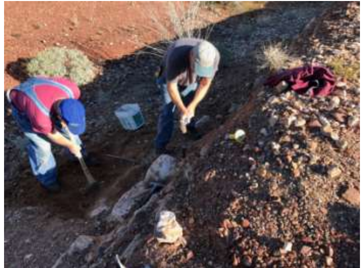
Steve Bryson and Al Yannity mining for Bacon Rock on one of the Quartzite Field Trips!

The LHGMS will gather on Plumosa Rd, just North of Quartzite. Plumosa Rd is about 6 miles North of Quartzite just past mile marker 119. Turn left and follow Plumosa Rd for about 2 miles and look for Blue Corner Flags, on the right, to guide you to our group. Barry Bandaruk's cell is 928-706-9382 for communication purposes.