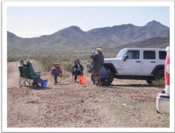
3-5-2017 Ft. Mojave