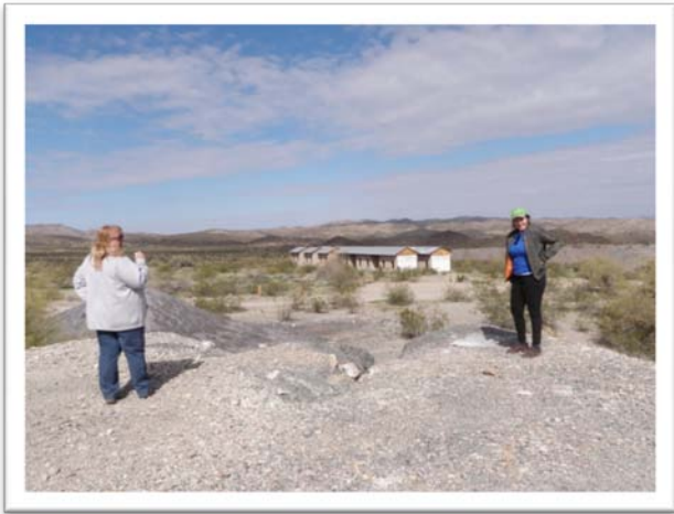
2/26/17 Swansea & other mining area