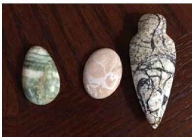
Lapidary & Cabochon Design

Come take a class and see how much fun it is!