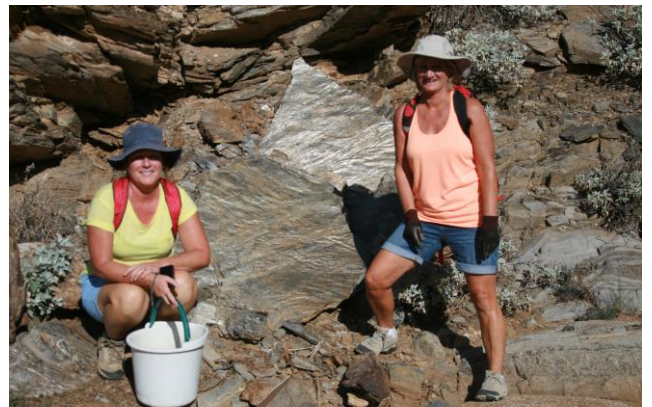
October 2014 Field Trip