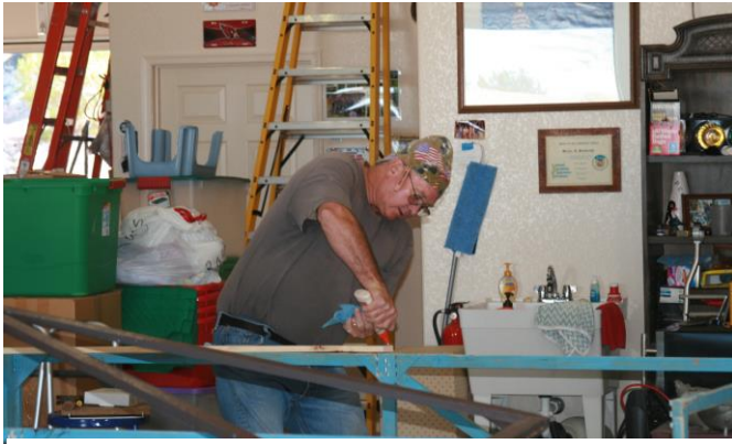
Getting Display Cases Ready for Gem Show